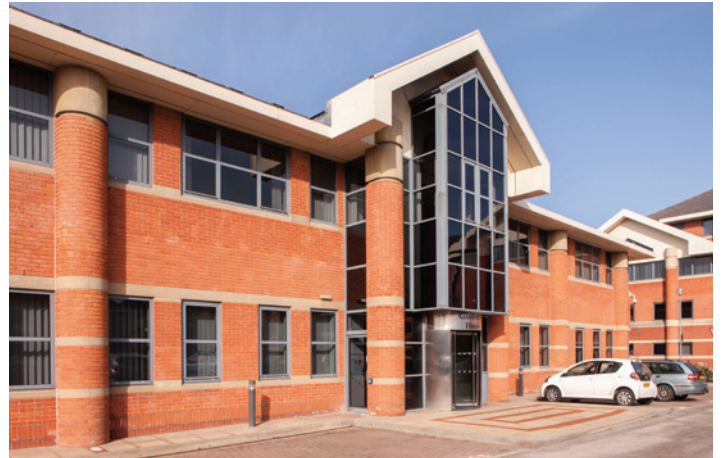
○ GLADSTONE HOUSE