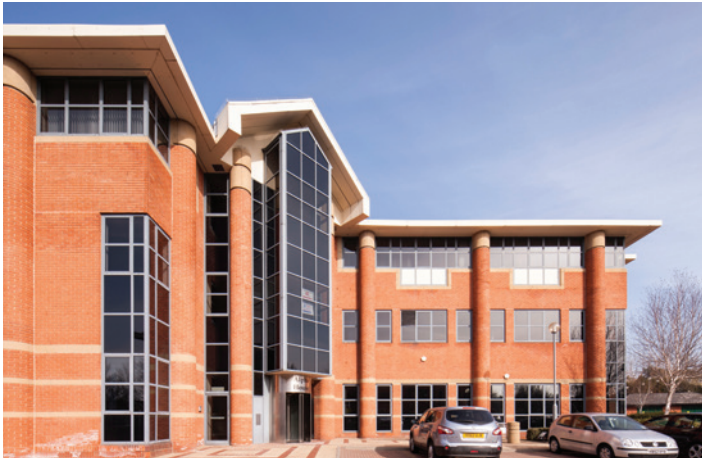
○ ALPHA HOUSE