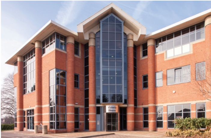
○ VICTORIA HOUSE