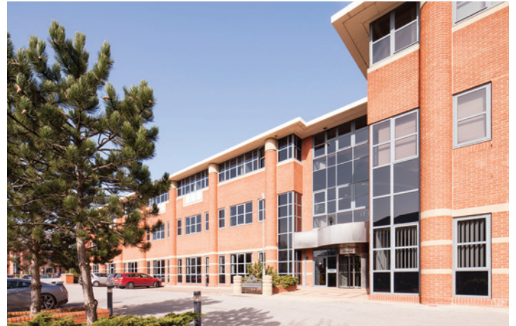
○ MAYESBROOK HOUSE